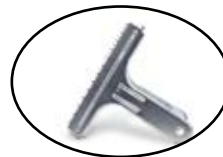
Cover Removal Tool 4053

Used to terminate individual conductors on MS 2 modules.