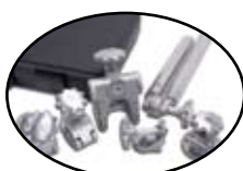
Tool Mounting Kit 3M710-TMK10-A

Used to plug up to seven super-mate modules together.